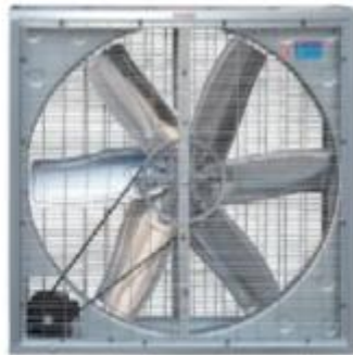
GLF-B豪华型方角扇 (加装后网不带百叶) GLF-B Axial Fan (With both side grilles)