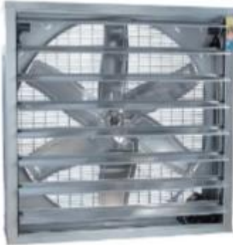
GLF豪华型方角扇 (带百叶) GLF Axial Fan (With shutter)